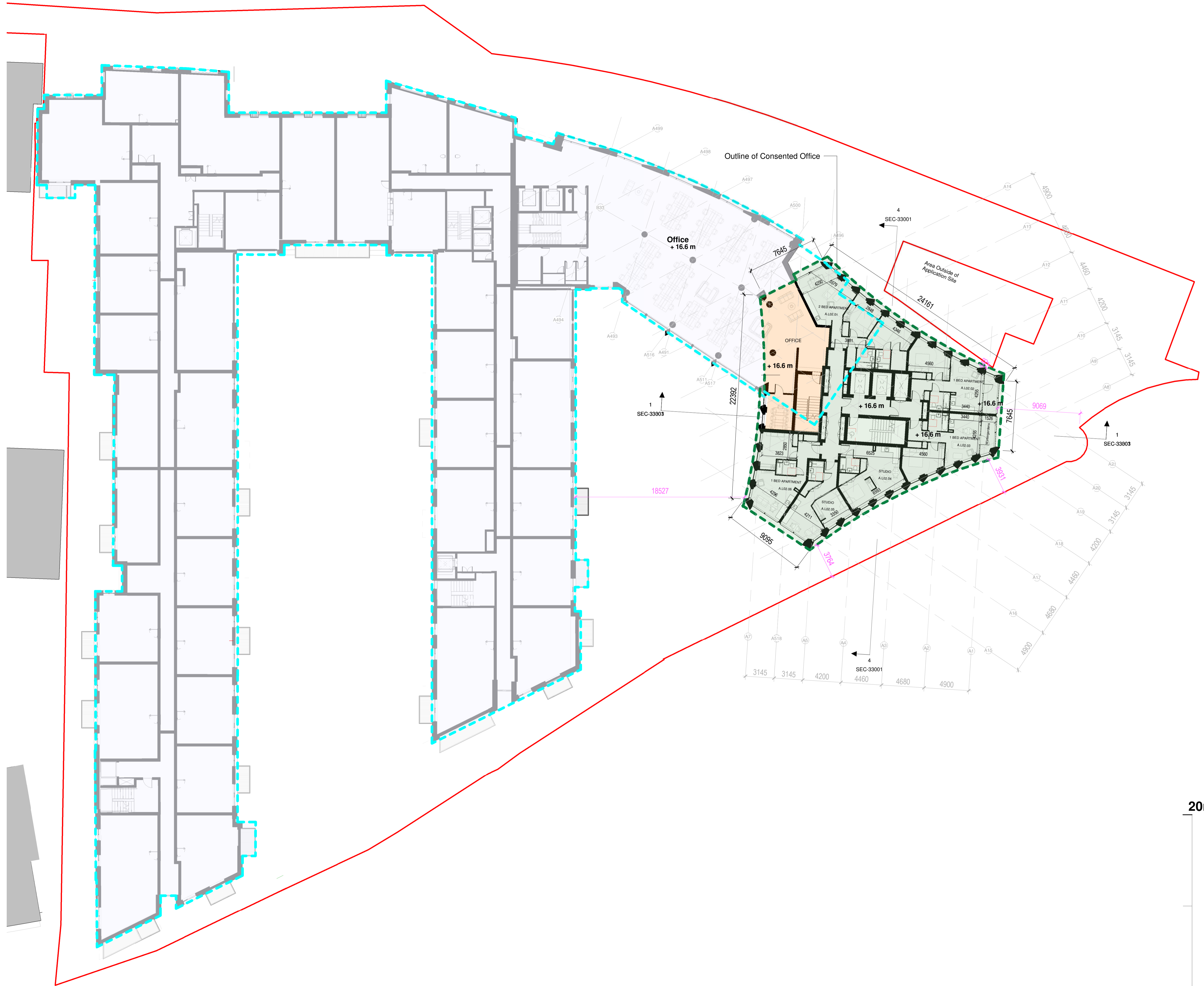
Proposed 2nd Floor Plan 1 : 200